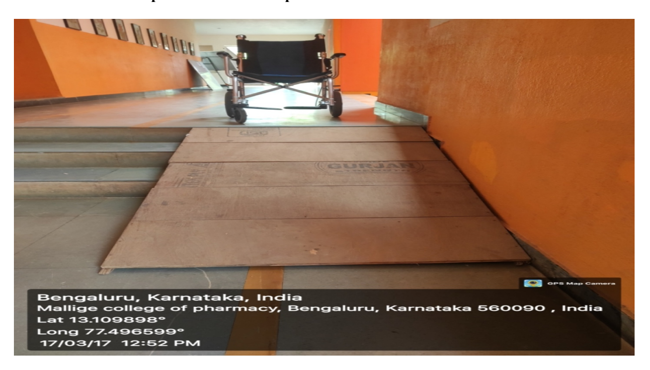
Ramp with wheel chair in the corridor of the ground floor in the premise