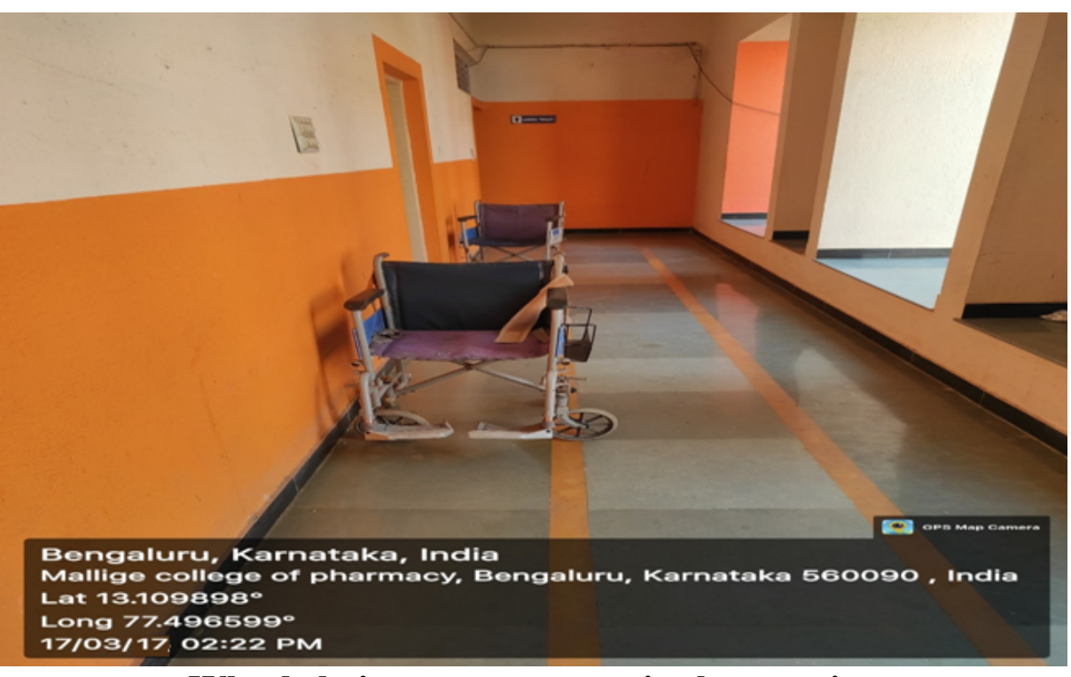
Wheel chairs near entrance in the premise