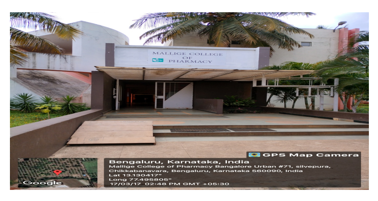
Ramp for wheelchair slope at the entrance of the Premise

#71, SILVEPURA, CHIKKABANAVARA POST, BANGLORE - 560 090 (Recognized by AICTE, PCI, New Delhi, RGUHS Bangalore) Web: www.mallige.ac.in, E - mail: mcpbangalore@ymail.com, Ph: 080-28446666, 9353729763